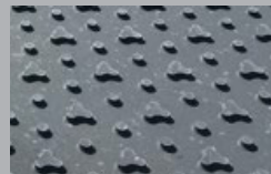
Side 1: Tire Track Surface