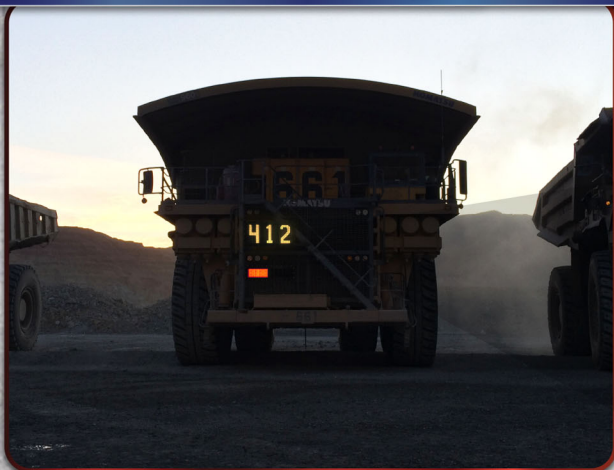
VID-3C12-MBCA-A-KIT (Amber LEDs) 12" Display shown above an 11"H Dual Color (Red/Blue) Signal Light Display with remote (VID-BL2SIG6-24V-R/B-KIT) on a minesite Haul Truck.

*Remote also sold separately (VID-M3XCR)